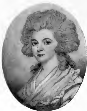
Russian Princesses By Edward Miles Page 210